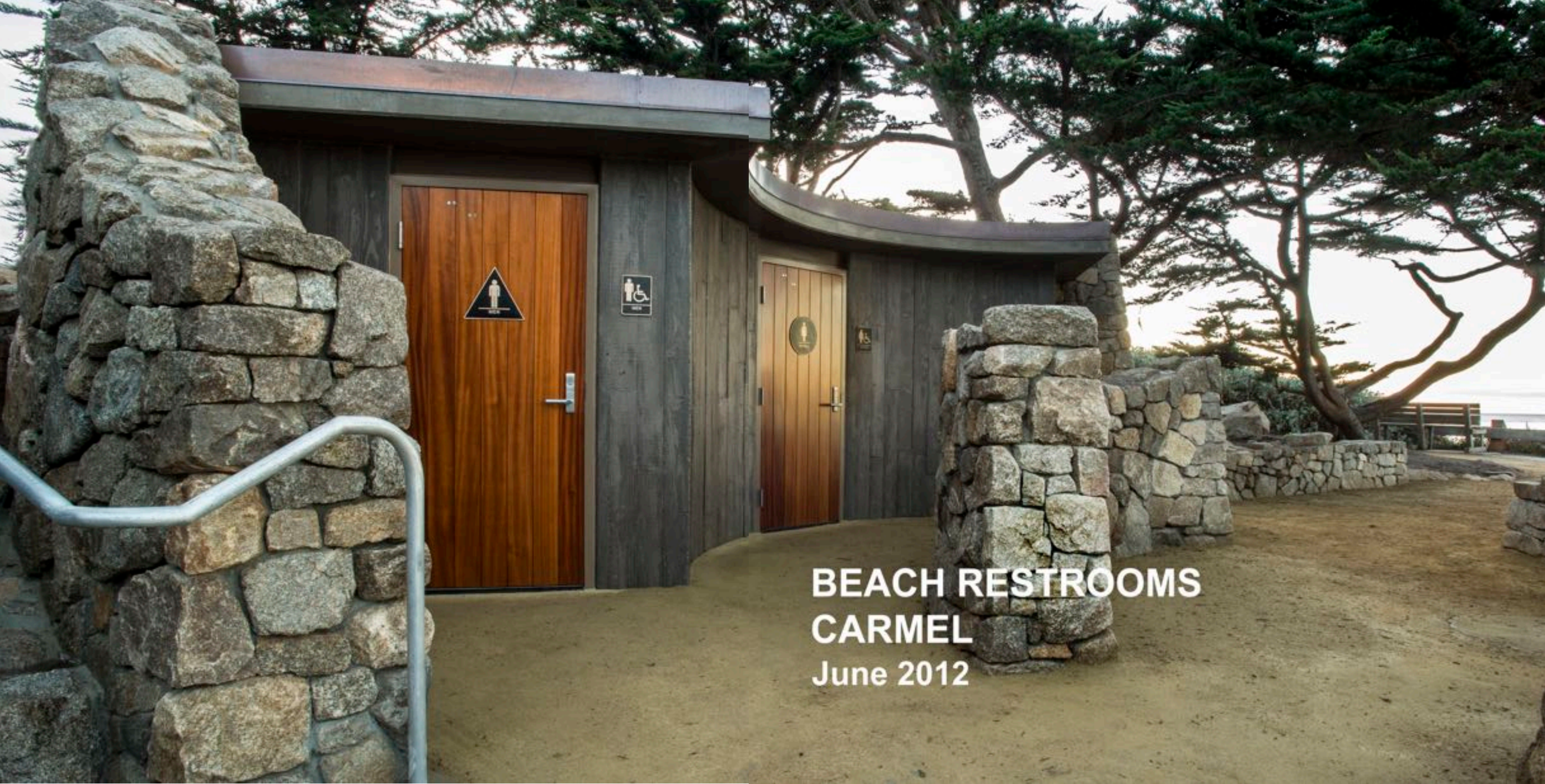
BEACH RESTROOMS CARMEL June 2012